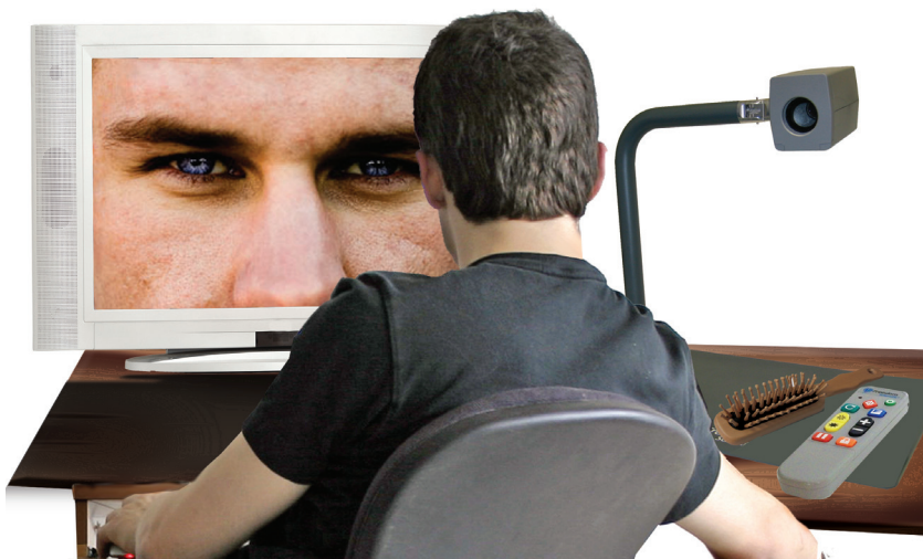
ONYX Swing-arm in self view

The 11 3/8-inch workspace under the camera provides the room you need to work on objects with your hands and tools. Use the Find Feature to aim at a distant object before zooming in. Auto Focus eliminates the need for constant refocusing as the viewing field changes. Use Focus Lock to keep an object or document in focus when working or writing under the camera. The unique Position Sensor function retains